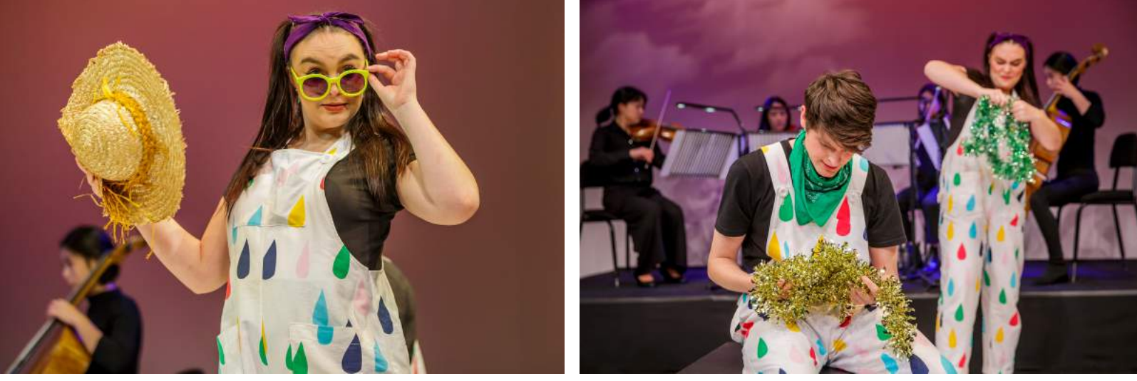
Suddenly, the music speeds up as Christmas shoppers rush around with bags and presents. The shoppers frantically untangle tinsel and exit to hang the decorations.

Mum pulls a large gold present from a white block on the stage. She finishes wrapping it and puts it by her chair. In a flurry, actors rush on to create a life-sized advent calendar. The giant calendar flap pop open as the days count down toward Christmas, revealing a different toys and games. The advent calendar dissolves and a child sneaks in to peek at the gold present.